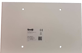
Female RJ45 adapter to TAB10s